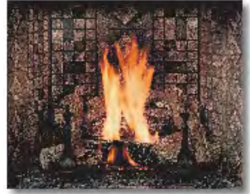
Diamond Mosaic Tile